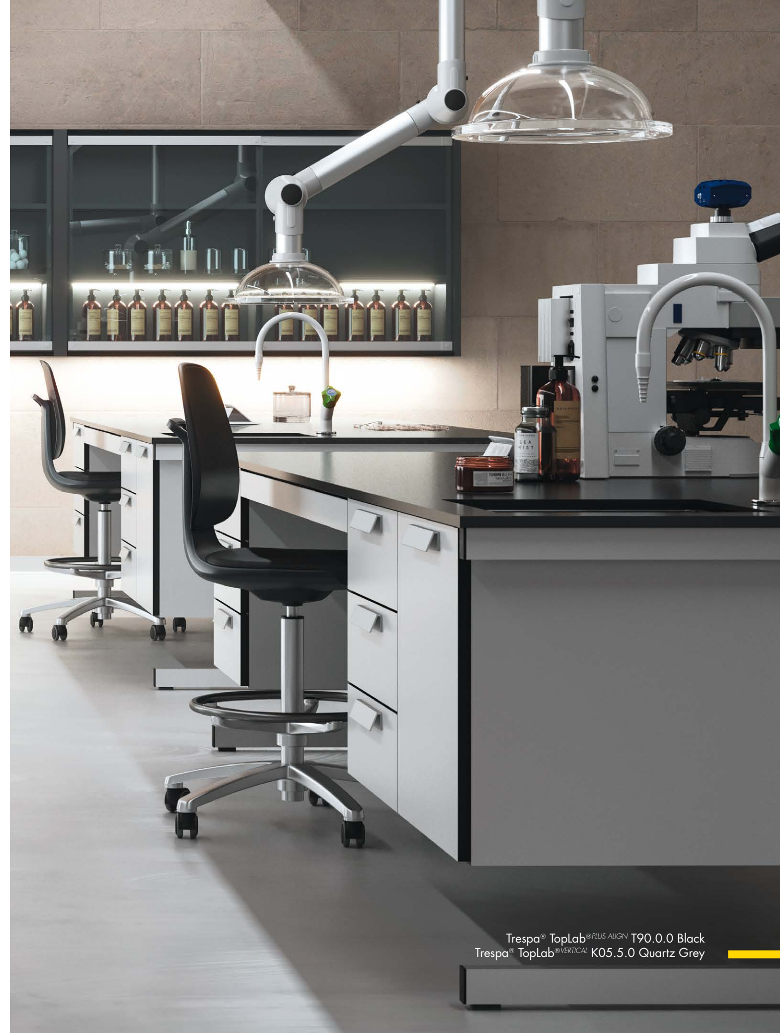
Trespa® TopLab® PLUS ALIGN T90.0.0 Black Trespa® TopLab® VERTICAL K05.5.0 Quartz Grey